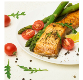
DINNER Grilled salmon and asparagus