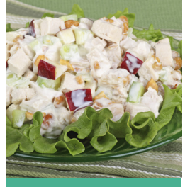
LUNCH Sunburst chicken salad